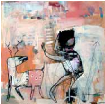
Engaging With Nature

acrylic, all pastel, and colored pencil on wood, 24" x 24"