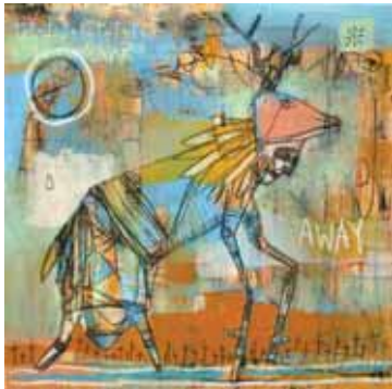
Away acrylic, oil pastel, and colored pencil on wood, 16" x 16"