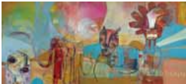
Old Cobra - He Knows the Difference Between Telephone Poles and Crosses He Knows They are Similar - He is an Old Cobra (cover image)

acrylic, oil pastel, and colored pencil on hollow-core door, 36" x 80"