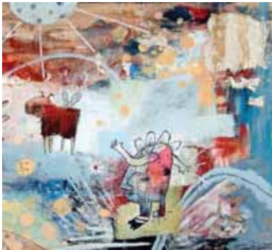
The Skeleton of Icarus Still Dreams From His Bones acrylic, oil pastel, colored pencil, and collage on wood, 24" x 48"