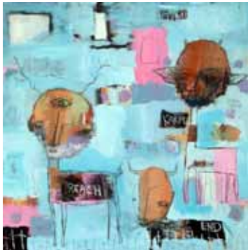
Karma Reach End

acrylic, all pastel, and colored pencil on wood, 24" x 24"