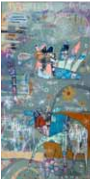
Ancient Future Many Times Above acrylic, oil pastel, and colored pencil on wood, 48" x 28"