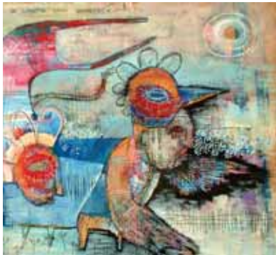
Walk With the Moon

acrylic, oil pastel, and colored pencil on wood, 24" x 48"