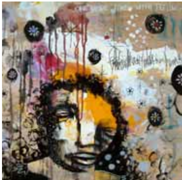
One More Time With Feeling

acrylic, oil pastel, and colored pencil on wood, 24" x 24"