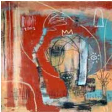
He Will Try to Take It With Him acrylic, oil pastel, and colored pencil on wood, 16" x 16"