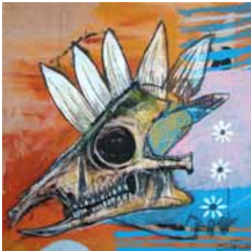
When an Idea Dies So Does Its Spirit acrylic, oil pastel, and colored pencil on wood, 16" x 16"