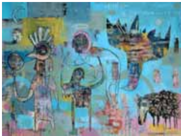
Phoenix acrylic, oil pastel, and colored pencil on wood, 36" x 48"