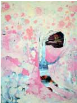
Into the Abyss

acrylic, oil pastel, and colored pencil on canvas, 40" x 30"