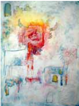
Goats Watch From Olympia

acrylic, oil pastel, and colored pencil on canvas, 40" x 30"