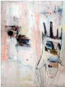
Guardian of the Pharaoh acrylic, oil pastel, and colored pencil on wood, 48" x 36"