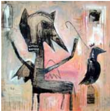
Cat Headed Crow Dog

acrylic, oil pastel, collage from previous works, and colored pencil on wood, 24" x 24"