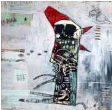
Many Tribes Made Him What He Is

acrylic, oil pastel, colored pencil, and acrylic transfer on wood, 20" x 20"