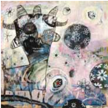
At the Edge of the World

acrylic, oil pastel, and colored pencil on wood, 20" x 20"