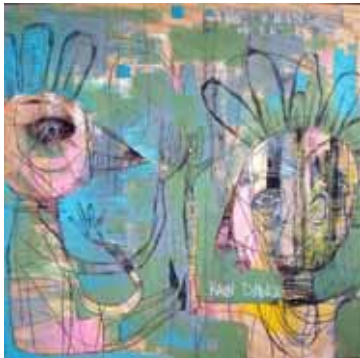
Rain Dance - Nothing To Return To acrylic, oil pastel, and colored pencil on wood, 24" x 24"