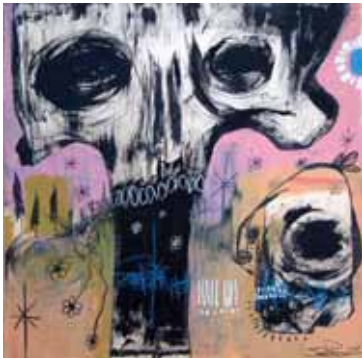
Some Days There is No Brighter Side acrylic, oil pastel, and colored pencil on wood, 20" x 20"