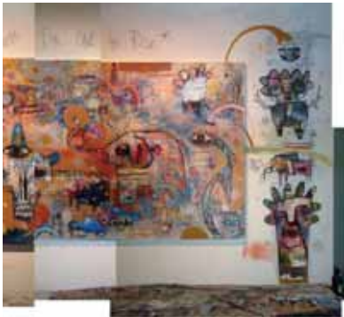
There Are Many Ways For One to Rise - It's More What You See Than What It Looks Like acrylic, all pastel, and colored pencil on wood and wall, 180" x 84" (interior installation painted live at BLK/WRKT GALLERY, Los Angeles CA)