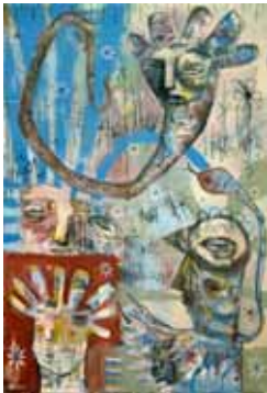
Truth Will Measure

acrylic, oil pastel, and colored pencil on canvas, 72" x 48" (painted live at Ayden Gallery, Vancouver BC)