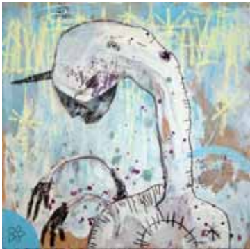
Last of Your Kind

acrylic, oil pastel, and colored pencil on wood, 16" x 16"