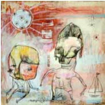
Ghost of the Past

acrylic, oil pastel, and colored pencil on wood, 24" x 24"