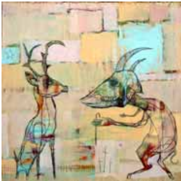
Teaching Death to Nature

acrylic, oil pastel, and colored pencil on wood, 24" x 24"