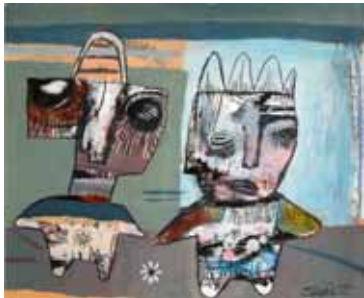
Be Aware of Your Position

acrylic, oil pastel, and colored pencil on paper, 14" x 17"