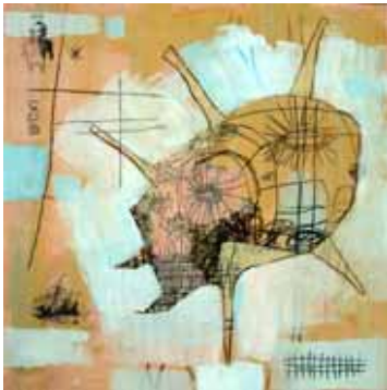
They Came By Boat

acrylic, oil pastel, colored pencil, and acrylic transfer on wood, 16" x 16"