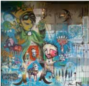
Puppet Master (Collaboration with Ashley Montague)

acrylic, paint marker, and spray paint on window, 84" x 84" (exterior installation at Local 35, Portland OR)