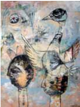
He Comes in Peace

acrylic, oil pastel, and colored pencil on wood, 28" x 20"