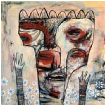
Flowers Will Collect Us

acrylic, oil pastel, and colored pencil on wood, 20" x 20"