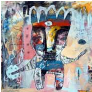
I Can See You Too

acrylic, oil pastel, and colored pencil on wood, 20" x 20"