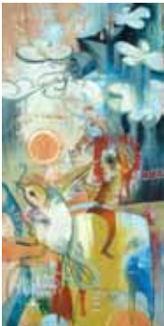
Exceed Yourself (Collaboration with Ashley Montague) acrylic, oil pastel, and colored pencil on wood, 48" x 24"