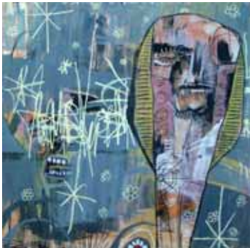
The Wisdom Of Snakes Can Be Seen In Their Movement

acrylic, oil pastel, and colored pencil on wood, 24" x 24"