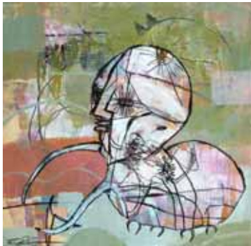
The Wishes of Insects

acrylic, oil pastel, and colored pencil on wood, 16" x 16"