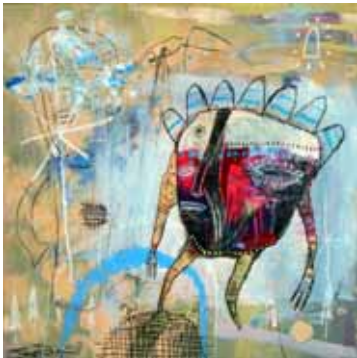
Tangled In Bear Traps

acrylic, oil pastel, and colored pencil on wood, 20" x 20"