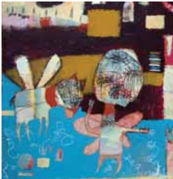
Phoenix (detail) acrylic, oil pastel, and colored pencil on wood, 24" x 24"