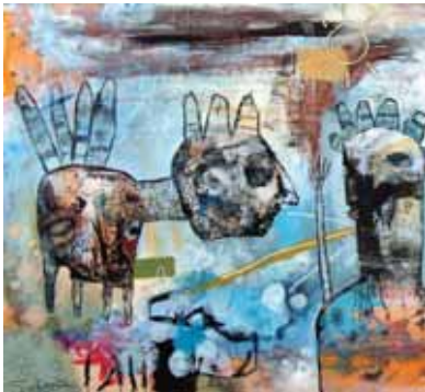
Conquest – The Journey of Lies

acrylic, oil pastel, and colored pencil on wood, 24" x 48"