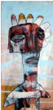
Towards the Horizon with only Flippers acrylic, oil pastel, and colored pencil on wood, 11" x 24"