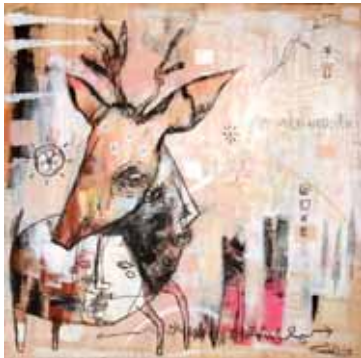
Staring at the Molecules of Moisture acrylic, oil pastel, and colored pencil on wood, 24" x 24"