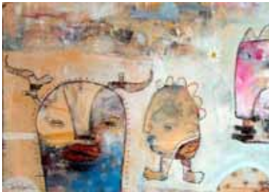
Little Did I Know Not Even Whales Are Safe

acrylic, oil pastel, and colored pencil on wood, 16" x 50"