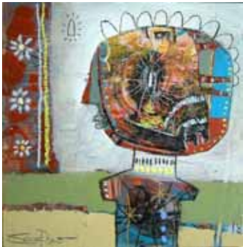
They All Expect a Bow

acrylic, oil pastel, and colored pencil on wood, 11" x 11"