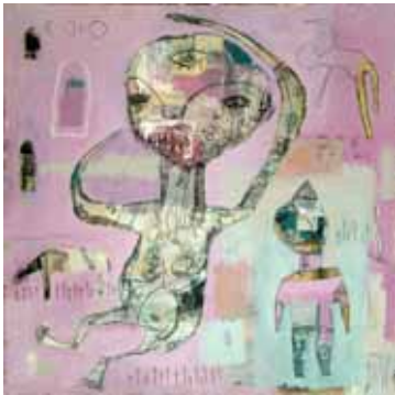
Three Eyed Baby

acrylic, oil pastel, and colored pencil on wood, 24" x 24"