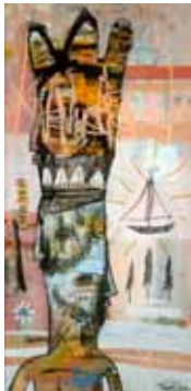
We Must Forget What We Know to Learn Something New acrylic, all pastel, and colored pencil on wood, 24" x 11"