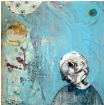
In a Blue World acrylic, oil pastel, collage from previous works, and colored pencil on wood, 16" x 16"