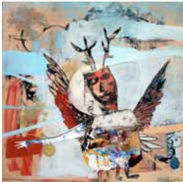
The Cup is Completely Empty

acrylic, oil pastel, collage from previous works, and colored pencil on wood, 24" x 24"