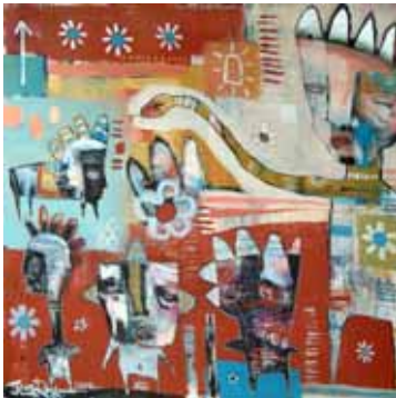
Reaching Out to the Tribe

acrylic, colored pencil, and paint marker on wood, 54" x 48" (exterior installation of The Goodfoot, Portland OR)