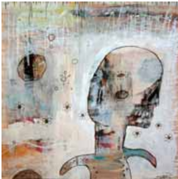
There Is Little Meaning in the Dreams of Empty Eyes acrylic, oil pastel, and colored pencil on wood, 24" x 24"